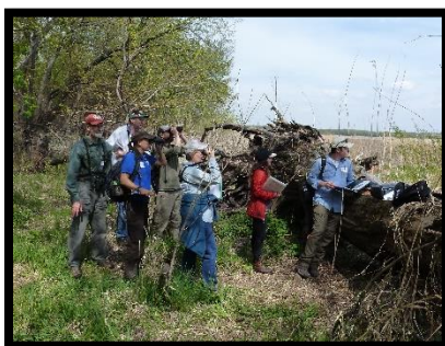
Figure 3 Volunteer Training by K Hall