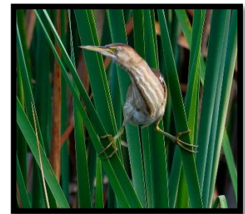
Figure 2LEBI by Rebecca Holmes

Focal species were detected in 20% of all observations including surveys conducted with no data (30%). The Sora and Virginia Rail appear to be the most represented focal species on the survey with the Yellow Rail showing the lowest number of observations. Of the secondary species monitored, the yellow-headed black bird was observed in the highest numbers and relatively early in the season which may indicate we were picking up on some migratory flocks. In the coming months we will conduct a more robust analysis of where the focal species were observed in order to begin to parse out some species detection and habitat suitability questions.