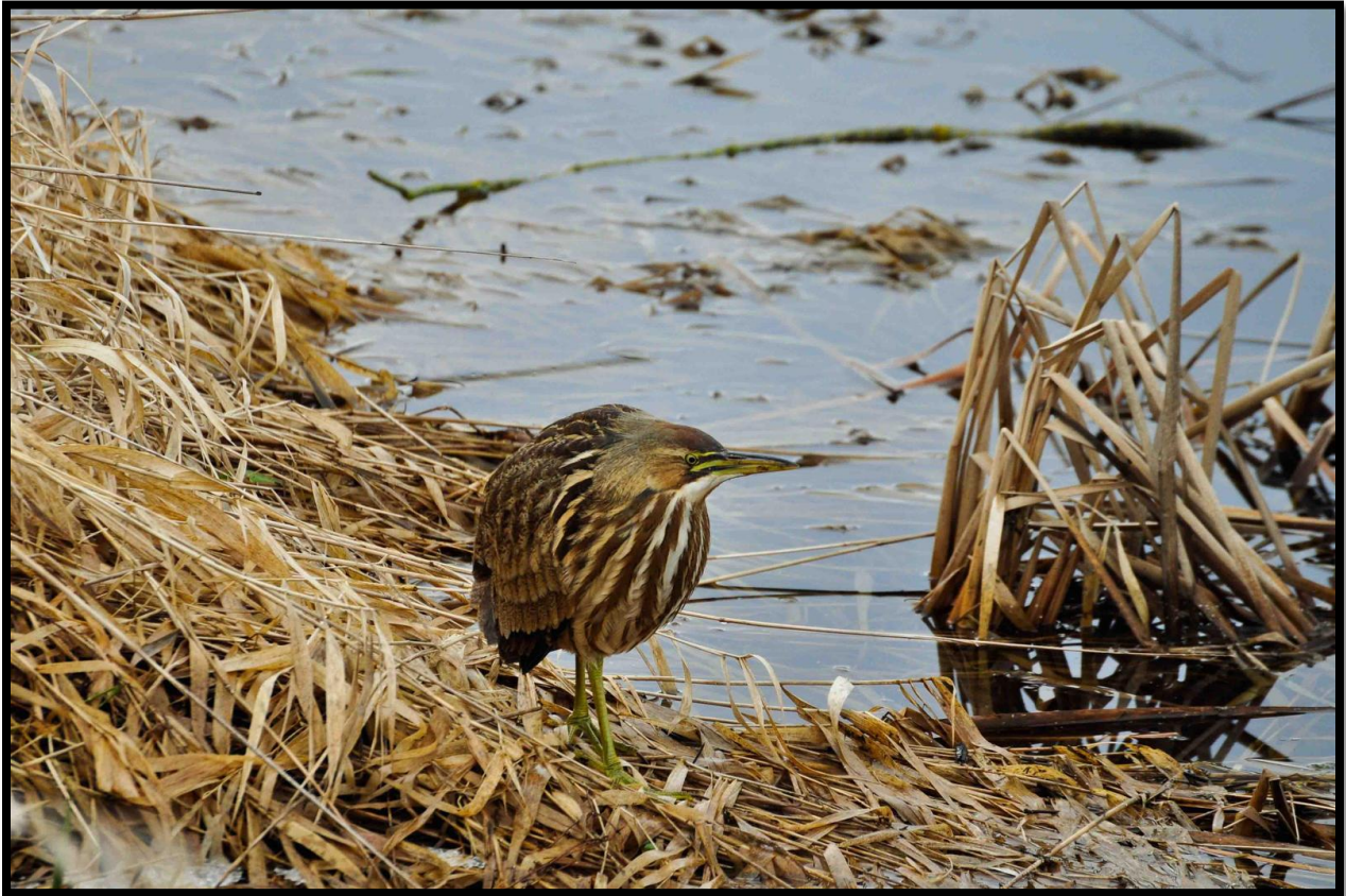
Figure 4 AMBI by Margo Burnison

As this is the first year of the survey, our current data set summary is preliminary. A more advanced analysis will be conducted after the second season is completed. One important element of our analysis going forward will focus on detectability. We have used the standardized marshbird survey protocol with the intention of collaborating regionally in order to determine marshbird population trends and potentially habitat needs throughout the Midwest. An investigation into species detectability under this standardized protocol would inform us on which species are more responsive to the call-back protocol and which are not. The differences in detectability and/or response to the playback on a species by species basis should inform our interpretation of survey results. For example, consider our low initial observations of Yellow Rail in this pilot season, it is possible that this methodology may not be appropriate to adequately detect Yellow Rails, or the protocol may need to be modified (i.e. time of day) in order to better survey for this species. As with many initial efforts, there are currently more questions than answers. However, as ever inquisitive birders, we look forward to continuing to refine our approach in order to develop a solid foundation for an ongoing secretive marshbird survey effort in Minnesota. Stay tuned in for updates and participation rallying cries in early spring!