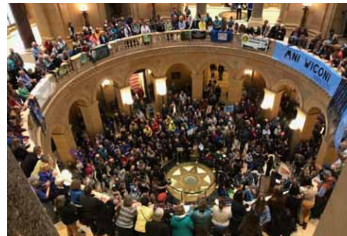
Audubon Minnesota was a sponsor of Water Action Day on April 19 at the State Capitol. Over 700 Minnesotans urged lawmakers to support the state's buffer law and other important safeguards for water.